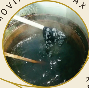
REMOVING THE WAX